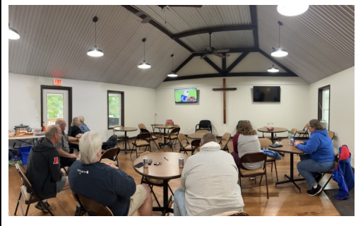
Mission Central/C&B 2.0 building 7778 Brewerton Rd. Syracuse NY 13212

10/9/22 - Buffalo Bills vs. Pittsburgh Steelers 11/20/22 - Buffalo Bills vs. Cleveland Browns 12/11/22 - Buffalo Bills vs. New York Jets